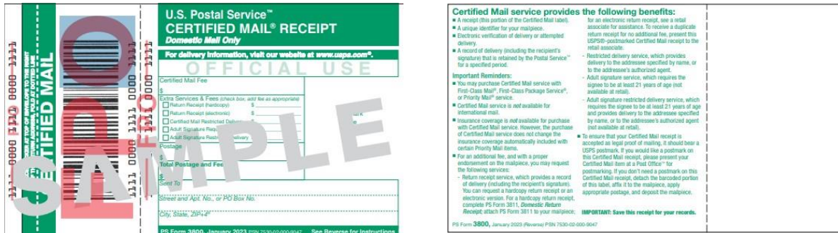
PS Form 3800, Certified Mail Receipt (front and back) 4

With respect to the “certified mail” component of registered mail, the U.S. Postal Service will provide the sender (if requested, and for a small fee) 2 a mailing receipt (PS Form 3800, Certified Mail Receipt) as confirmation that an item was sent. Although certified mail does also require a signature from the recipient, it does not provide the sender a return receipt with proof of signature, unless that service is separately requested (see below). 3